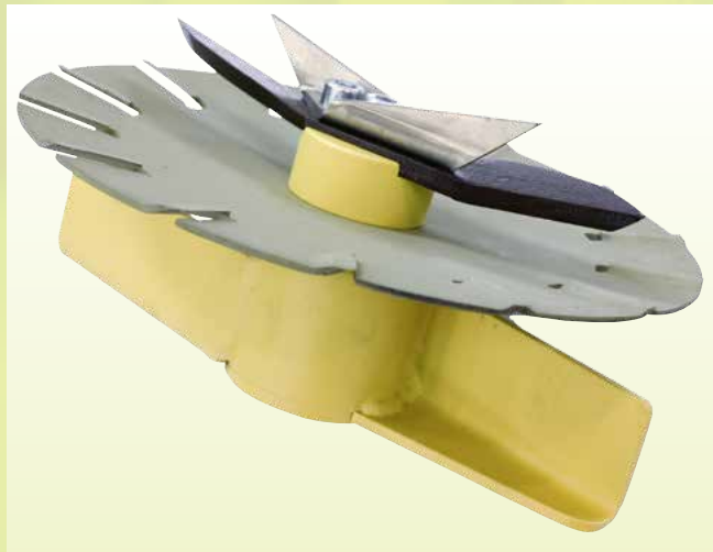
Blade rotor complete